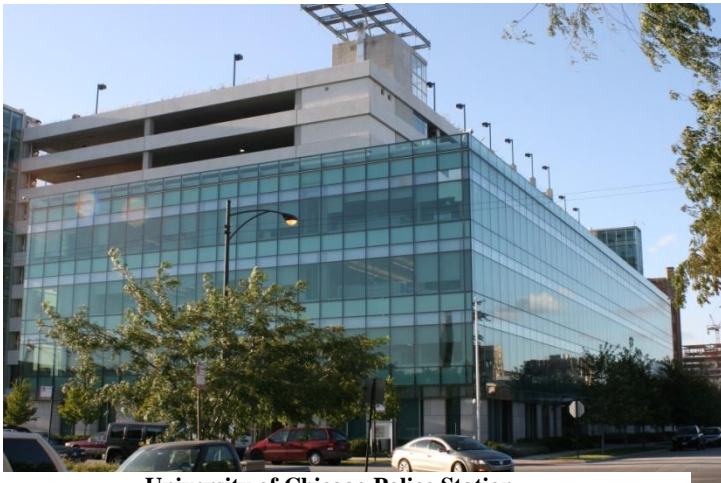
University of Chicago Police Station