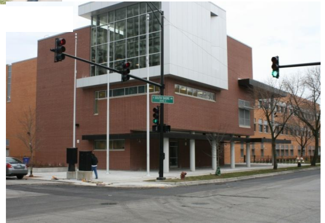
Powell Elementary School