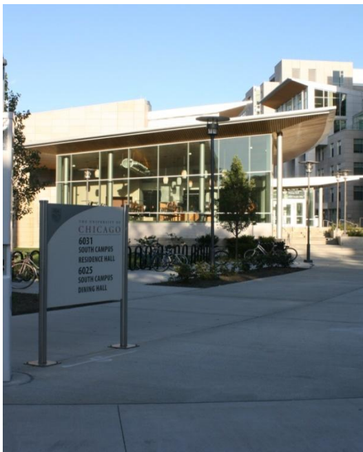
University of Chicago South Campus Dining Hall