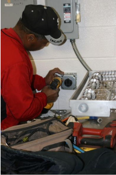
Maintenance at Us Cellular Field