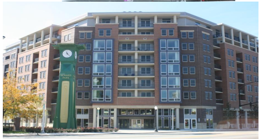
Parkside of Old Town